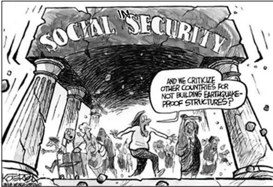
Source: Jeff Koterba, Omaha World Herald , March 15, 2010 (adapted)

Base your answer to question 45 on the cartoon below and on your knowledge of social studies.