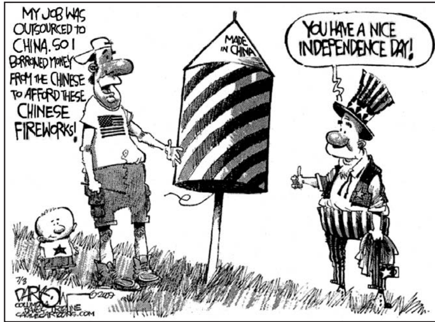
Source: John Darkow, Columbia (MO) Daily Tribune , July 3, 2009 (adapted)

Base your answers to questions 43 and 44 on the cartoon below and on your knowledge of social studies.